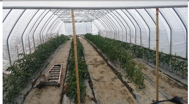
Market Garden Grow Tunnels