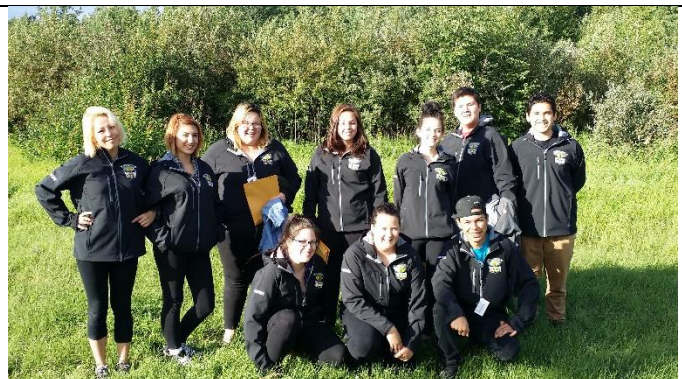
Junior Resource Rangers