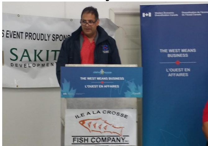
Fish Plant Funding Announcement